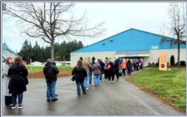
Attendees eagerly lined up in the rain early Saturday morning to be among the first to enter Presidents' Hall for the 2026 Kitsap Antique Show.

We look forward to building upon this year's momentum with another exciting show next year, which is already being planned. Although we want to continue to schedule it to take place on the third weekend in February, the committee is exploring the possibility of having a Friday-Saturday show, instead of the traditional Saturday-Sunday format, based upon feedback from dealers and the apparent success of that arrangement for similar shows in the Pacific Northwest. The decision about the dates will be made before the end of April, after which we will immediately begin publicity efforts for 2027. As always, the show committee much appreciates the help of PSGS members who share the show's social media postings as widely as possible!