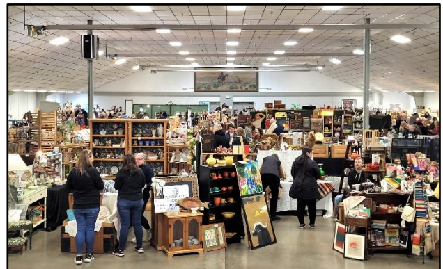
Twenty-eight dealers from Washington, Oregon, and California offered show attendees a wide variety of antiques, vintage items, and collectibles.